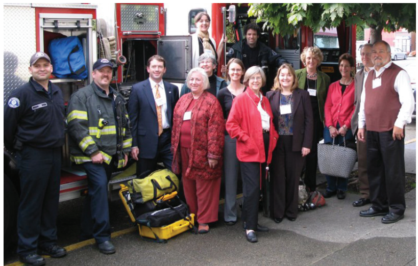
PRS volunteer consultants enjoy an informative visit from the Seattle Fire Department.